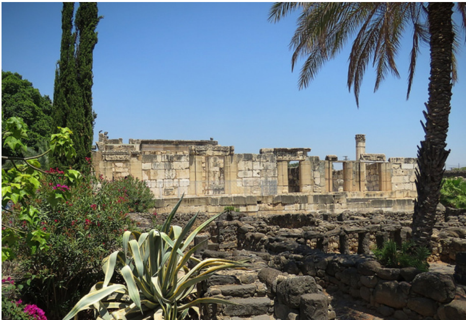
Capernaum, Jewish Temple from the time of Jesus