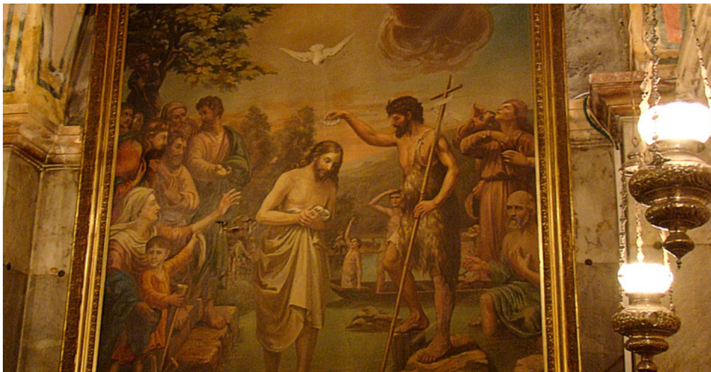
En Karem, St. John & Jesus, Baptism In River Jordan