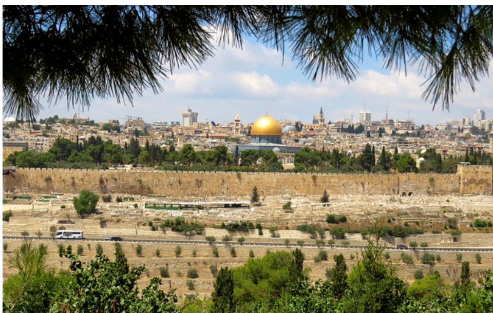
Jerusalem, view from Mount of Olives

Today we will fly back home , depending on the flight arrangements, and your arrival back home will be the same day!